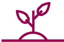
Land and new homes